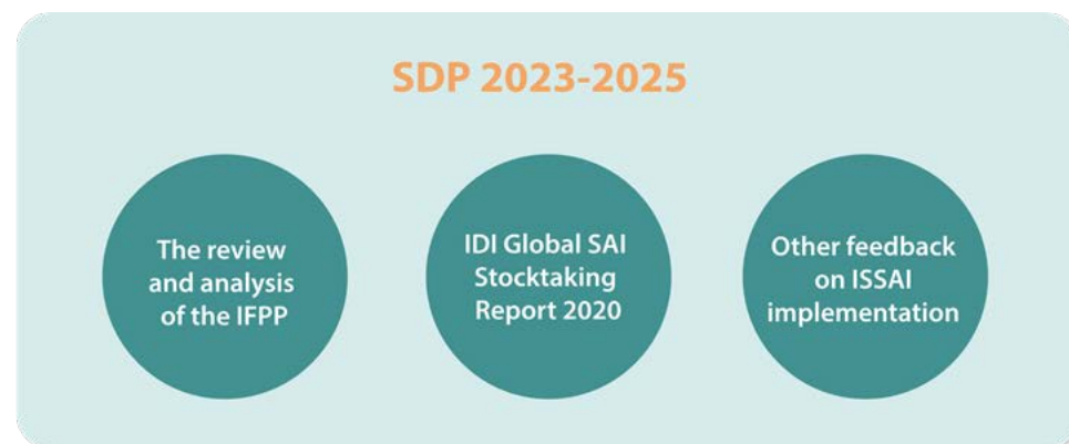
Figure 2: Sources used in the analysis leading up to the SDP 2023-2025.