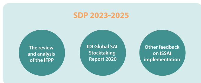
Figure 2: Sources used in the analysis for the SDP 2023-2025.

Kommentert [BZ4]: Unclear sentence, revision suggested.