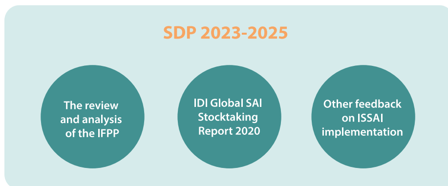
Figure 2: Sources used in the analysis for the SDP 2023-2025.

Several sources of information from users of the IFPP indicate challenges in implementing the framework due to a lack of clarity. In addition to the review and analysis of the IFPP , the IDI Global SAI Stocktaking Report 2020 file (idi.no) concluded that three main and feedback from working bodies within INTOSAI engaged in standard setting.